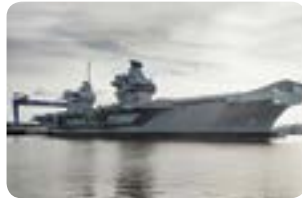
Queen Elizabeth class aircraft carrier

approved cost of two new Queen Elizabeth Class aircraft carriers