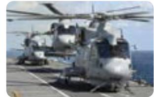
Merlin Mk2 helicopters (for hosting Crowsnest)

cost of developing and buying the airborne radar system to protect the carriers (Crowsnest)