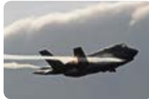
Lightning II fast-jet

forecast cost of Lightning II procurement up to March 2021